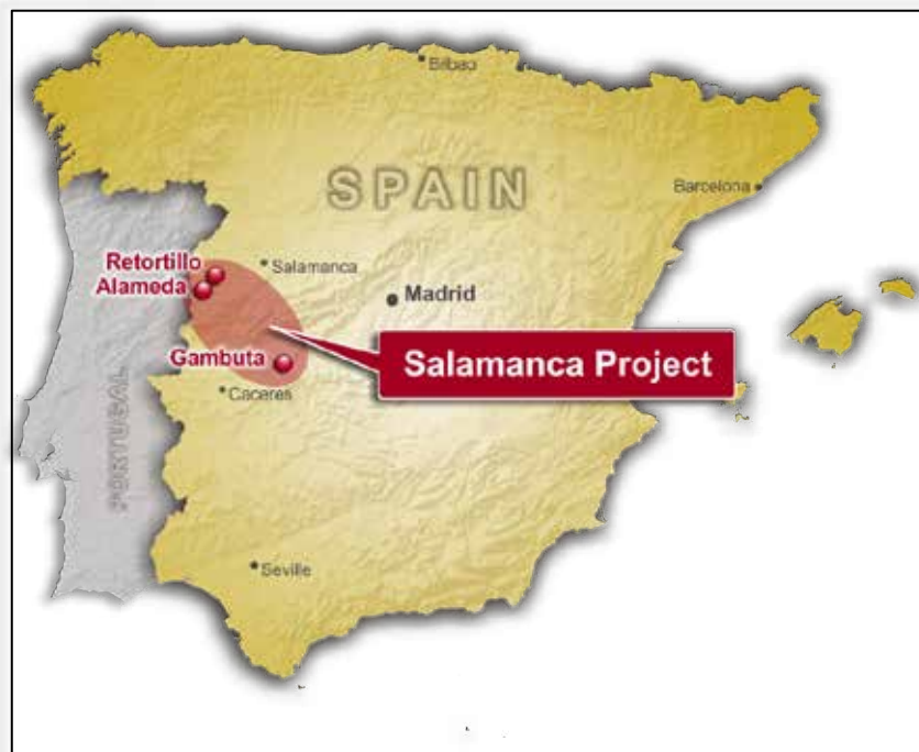
Figure 1: Location of the Salamanca Project, Spain

The Project hosts a Mineral Resource of 89.3Mlb uranium, with more than two thirds in the Measured and Indicated categories. In 2016, Berkeley published the results of a robust Definitive Feasibility Study (“DFS”) for Salamanca confirming that the Project may be one of the world’s lowest cost producers, capable of generating strong after-tax cash flows.